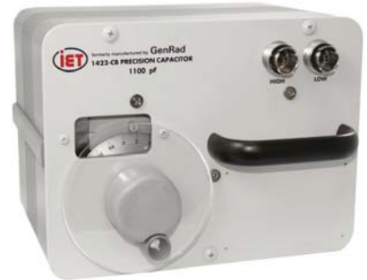
Model 1422-CB/CL/CC Precision Capacitor