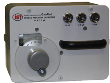
Model 1422-CD Precision Capacitor