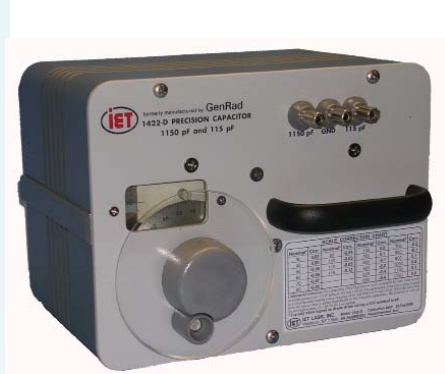
Model 1422-D Precision Capacitor